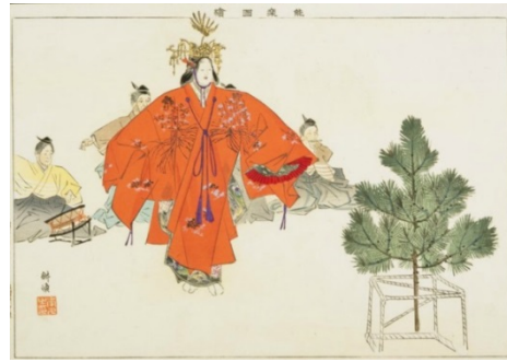
Paintings of "Hagoromo" by renowned artist Kogyo Tsukioka