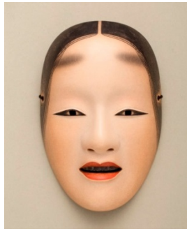
Noh Mask "Zou-Onna"