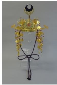
Heavenly Crown "Tenkan"