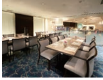
Super Buffet /2F Glass Court