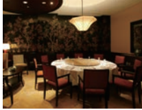
Chinese Dining /2F Nan-En