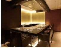
Teppan-yaki /7F Yamanami