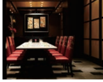
Japanese Cuisine /2F Kagari