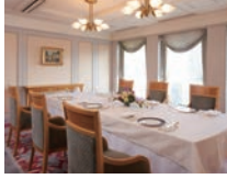
French & Italian Cuisine /44F Duo Fourchettes