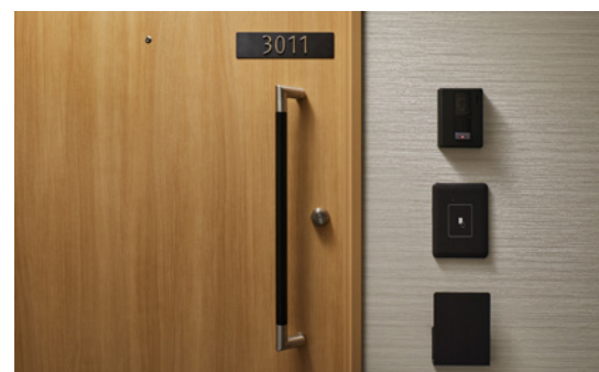
Door handles, key readers, and intercoms are at a suitable height for those in wheelchairs, and room number plates are 3D with finger-friendly surfaces for blind guests.