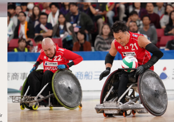
2019 World Wheelchair Rugby Challenge