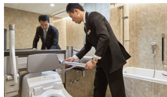
Bathrooms are fitted with amenities for those with disabilities.

For more than three decades, we have made it our priority to ensure that everyone who comes to stay in our hotel — without exception — is comfortable.