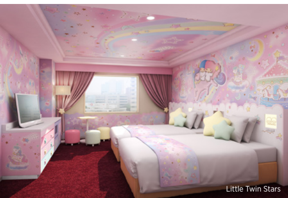
Little Twin Stars