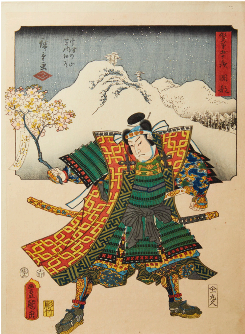
Ukiyo-e woodblock print by Hiroshige/Toyokuni