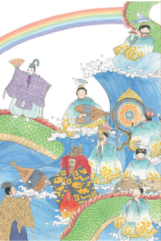
BY TOKIMATSU HARUNA