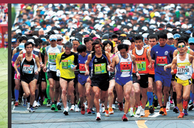
A scene from the 25th Kasumigaura Marathon/International Blind Marathon—runners with visual disabilities make a start (photographed on April 19th, 2015)