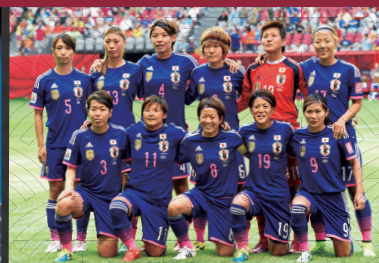
Japan's team facing its Dutch counterpart in FIFA Women's World Cup Canada 2015™ (photographed on June 23rd, 2015)