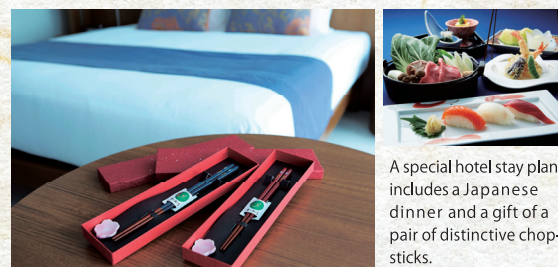
A special hotel stay plan includes a Japanese dinner and a gift of a pair of distinctive chopsticks.