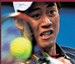
Kei Nishikori making a forehand shot in the third round of the Australian Open men's singles (photographed on January 24th, 2015)