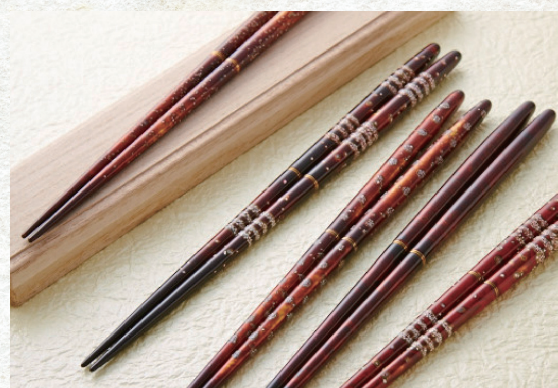
Chopsticks are available for purchase. Let color, design, and size be your guidelines when choosing a favorite pair.