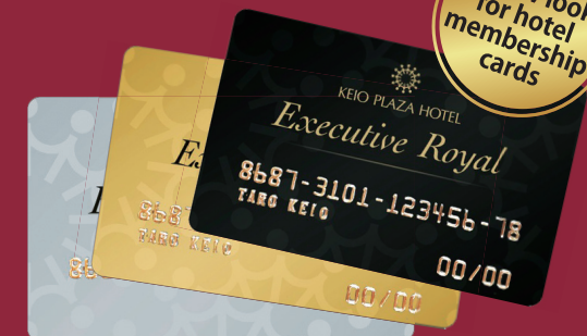
Left to right: The new Bloom, Prime, and Royal cards

* The points will be earned for each 100 yen expended (tax excluded). * Some exceptions apply.