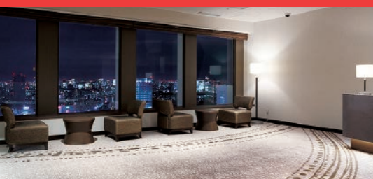
The foyer on the 47th floor lets you take in Tokyo's sweeping nightscape.