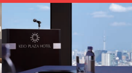
The banquet hall is the perfect place for entertainment with a dazzling view of Tokyo.