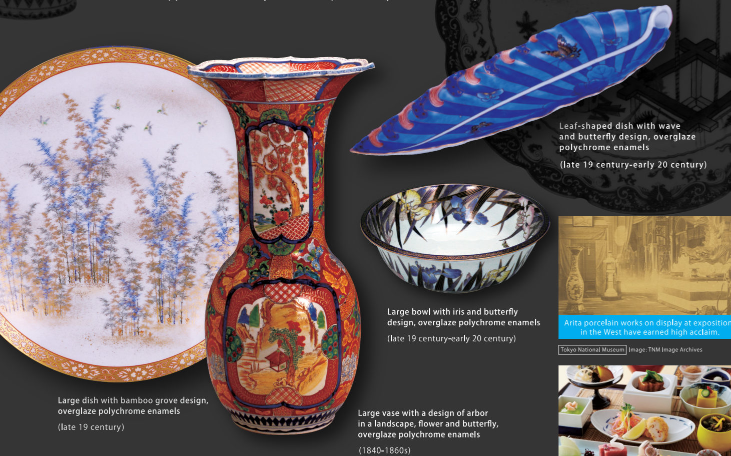
Large dish with bamboo grove design, overglaze polychrome enamels (late 19 century)

Until August 2nd, the Keio Plaza Hotel is holding a comprehensive event showcasing the Arita and Imari schools of porcelain, whose gorgeous, meticulous workmanship enchanted many in Europe and gave rise to the so-called "Japonism" aesthetic. The lobby exhibition space is modelled after similar spaces from famed expositions in Europe. Some extremely precious works of porcelain will be on display, including one piece that is more than 2 m (2.2 yards) in size. Also, renowned pottery workshops will exhibit and sell their works, while some of our restaurants will offer special meals served in Arita and Imari porcelain. This is an excellent chance to appreciate the many facets of Japan's 400-year tradition of porcelain crafts.