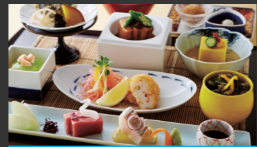
Some of our restaurants offer special cuisine served in Arita and Imari porcelain in July.

Tokyo National Museum | Image: TNM Image Archives