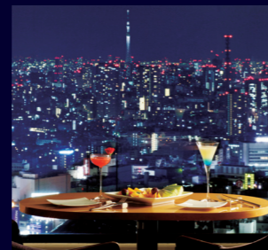
The Aurora Lounge is the perfect place to view fireworks and Tokyo Skytree.

Japan's hanabi (fireworks) stand out as a summer symbol, known for their brilliant variation of colors and carefully crafted designs. The word hanabi literally means "flowers-of-fire." Blossoming in the night sky, these "fire flowers" have enchanted generations of Japanese people. On summer weekends, many fireworks festivals are held across the nation, including in Tokyo, with one of the most famous being the "Tokyo Bay Grand Fireworks Festival." To this day, many spectators attend the events clad in yukata , a casual kimono, while food stalls line up to sell traditional Japanese snacks.