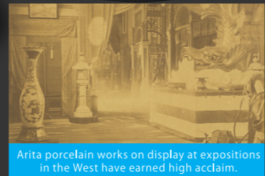
Arita porcelain works on display at expositions in the West have earned high acclaim.

Tokyo National Museum | Image: TNM Image Archives