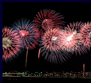
The brilliant colors and designs of Japan's fireworks are applauded both at home and abroad.